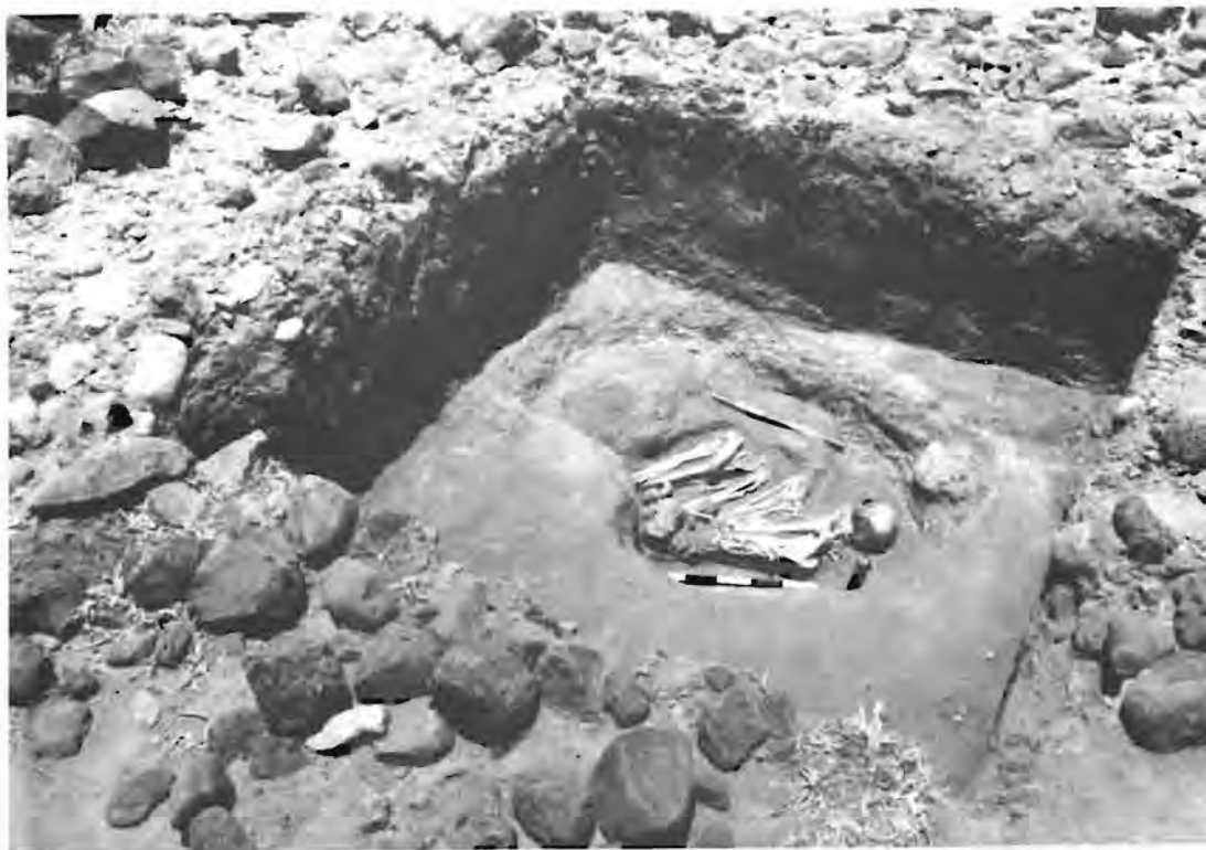
Right: Burial excavated from a ring cairn at Kalacha. The upper and lower middle incisors were missing, suggesting Nilotic influence.