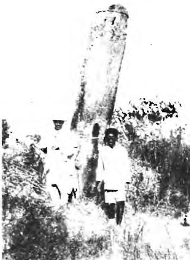
Prehistoric phallic megaliths from southern Ethiopia. From J.E. Jensen (1936), Im Lande des Gada , Stuttgart.