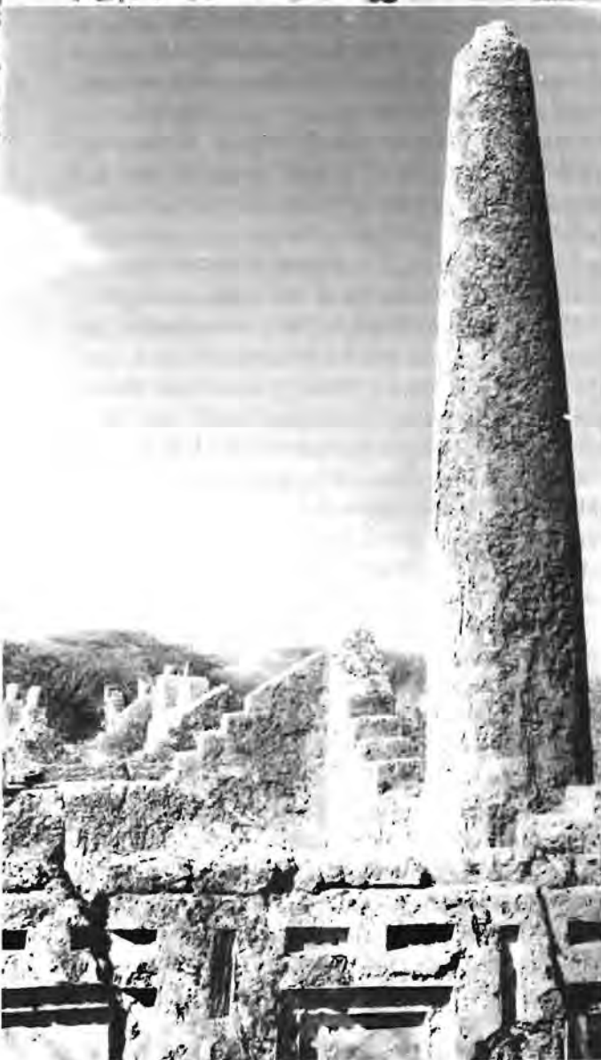
Islamic tombs with phallic pillar, Ishikani.

given to the East African coast as far south as Mozambique (it is thus a misnomer to apply it to South Africa). Some of the people living along the northern parts of this coast were described as being tall, bearded, long-haired and 'red' in colour, which fits in with an idea of caucasoid 'Hamites'. These people were pastoralists. Huntingford believed that it was such Hamitic pastoralists as described in the early Greco-Roman writings who descended into Kenya to create the structures we find today archaeologically.