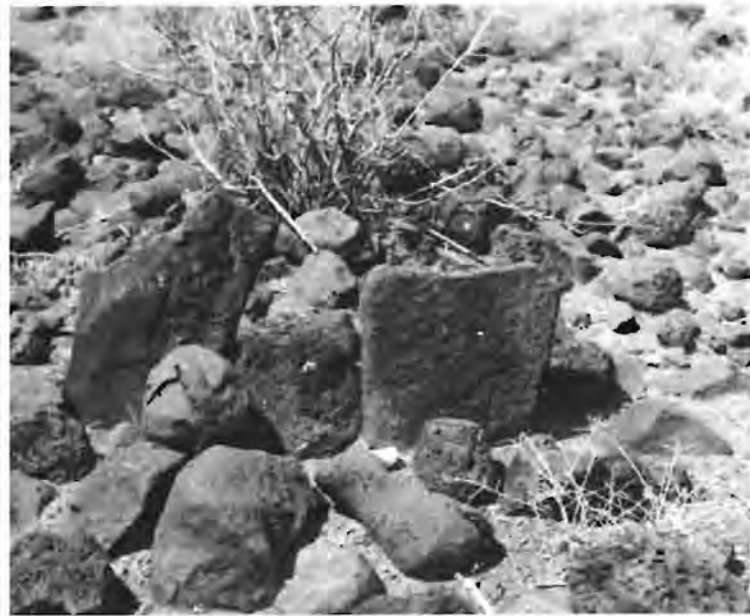
Soddu stones from a ring cairn.