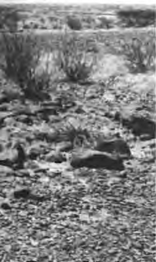
Above: "Archaeo-astronomic" pillars from Namoratunga. They may be soddu stones.